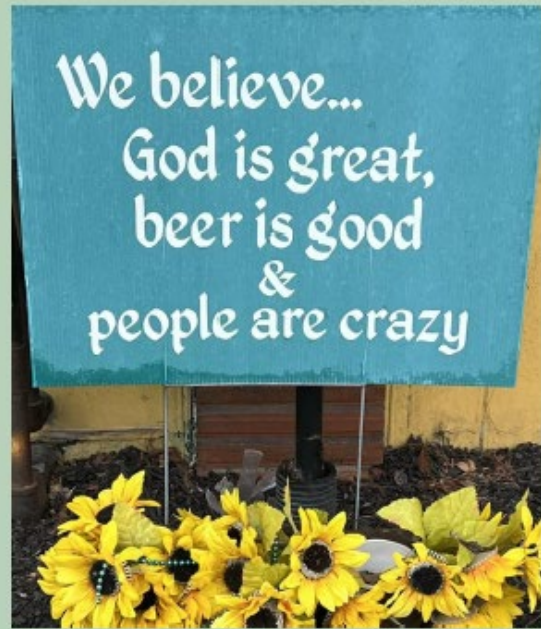
Seen Along the Parade Route